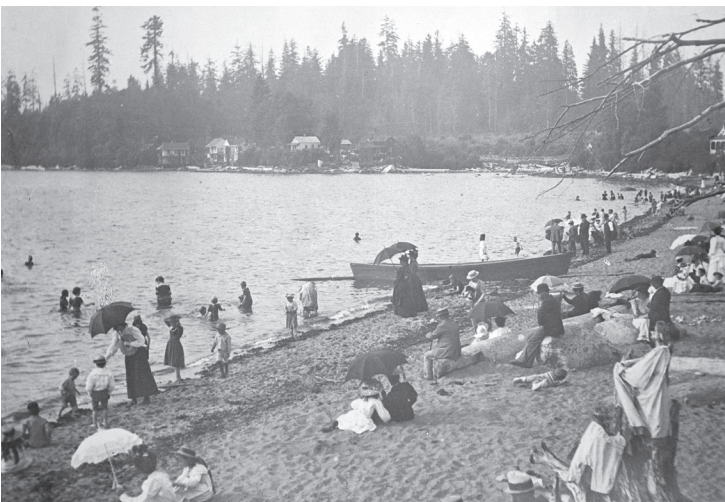
Second Beach - 1890-95

What once was old is new again; our love of the beach will endure.